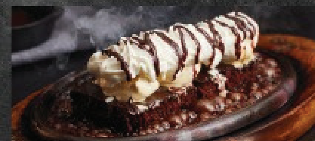
TORO'S SIGNATURE SIZZLING BROWNIE

Delicious chewy chocolate fudge brownie smothered in rich chocolate fudge and chocolate sauce. Served with vanilla ice-cream, whipped cream and chocolate sauce.