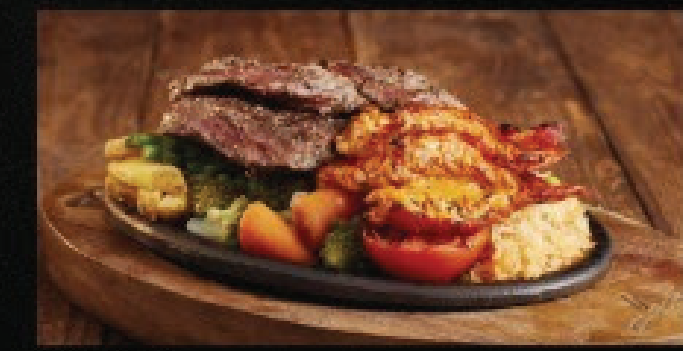
SURF N TURF