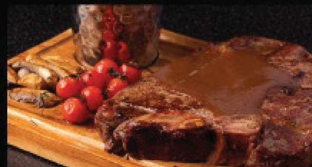
AGED PORTER HOUSE