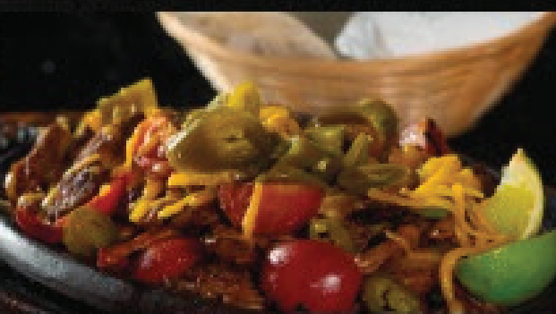
MEXICAN SIZZLING FAJITA